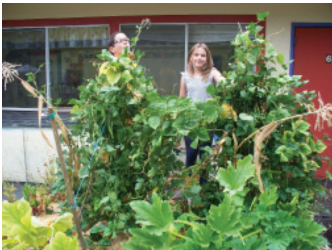
Class Garden Project